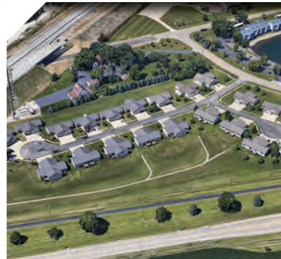
Hampton Place Subdivision Multi-Family Housing Development 23 duplexes | 2 & 3 bedrooms 46 living units