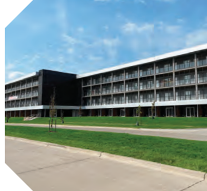
The Bend Apartments Luxury Apartments 4 stories | 50,183 sq ft 72 living units