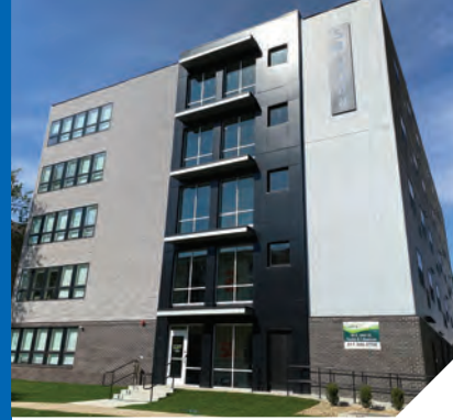
54 John Apartments Student Housing 5 stories | 39,415 sq ft 65 living units