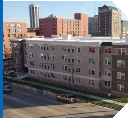
Villas Downtown Springfield Mixed Use | Housing 4 stories | 52,516 sq ft 79 living units